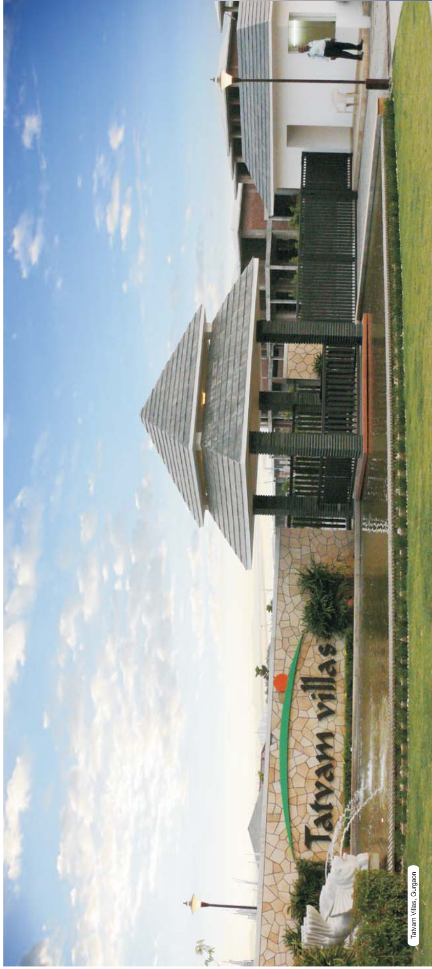
Tatvam Villas, Gurgaon