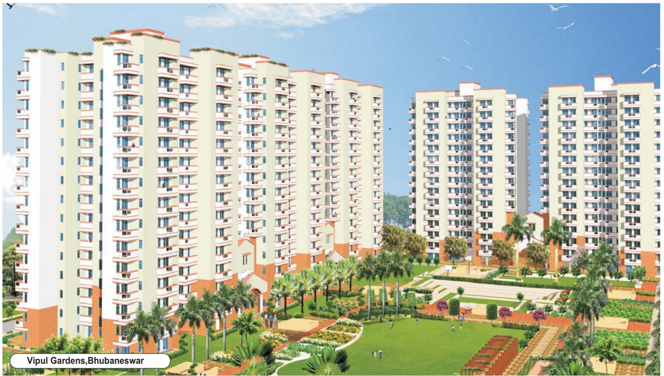
Vipul Gardens, Bhubaneswar