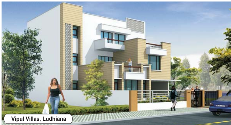
Vipul Villas, Ludhiana