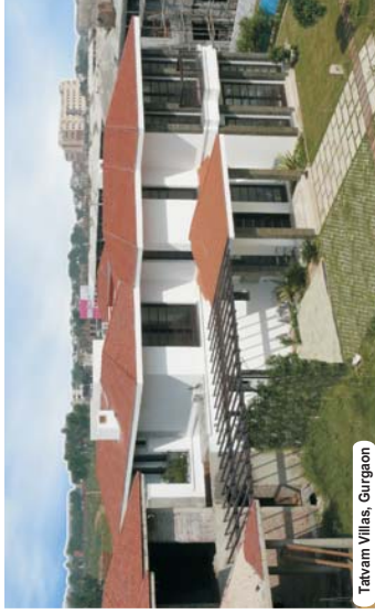
Tatvam Villas, Gurgaon