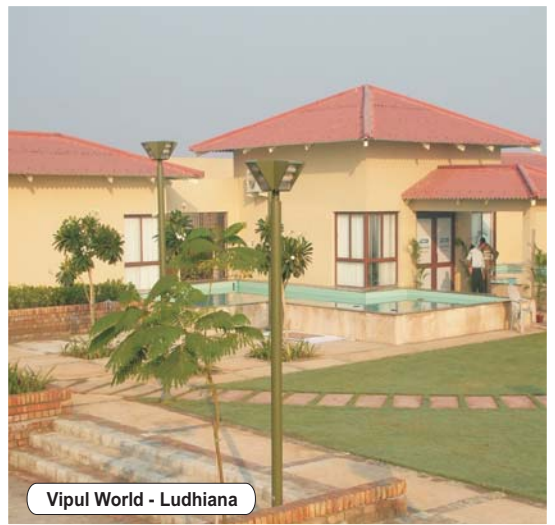
Vipul World - Ludhiana