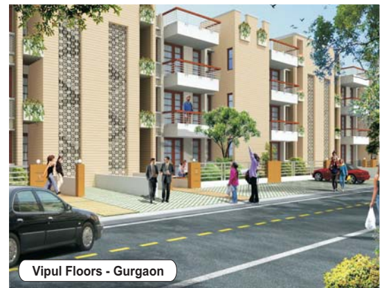
Vipul Floors - Gurgaon