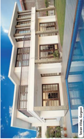
Tatvam Villas, Gurgaon