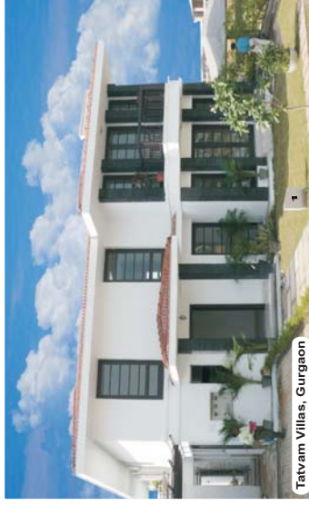
Tatvam Villas, Gurgaon