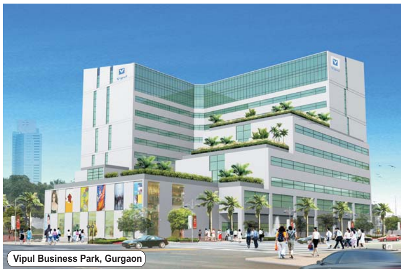
Vipul Business Park, Gurgaon