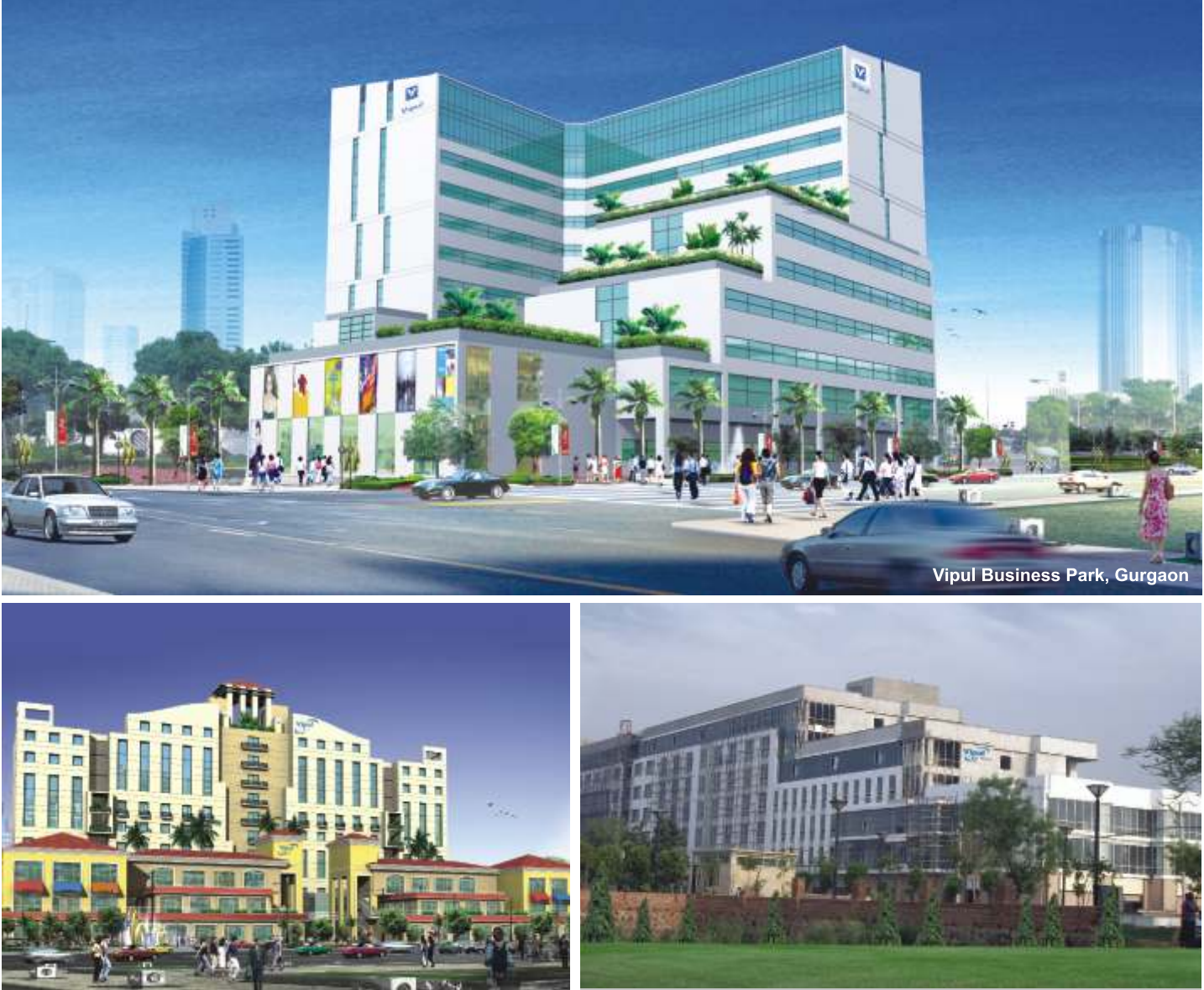
Vipul Plaza, Faridabad