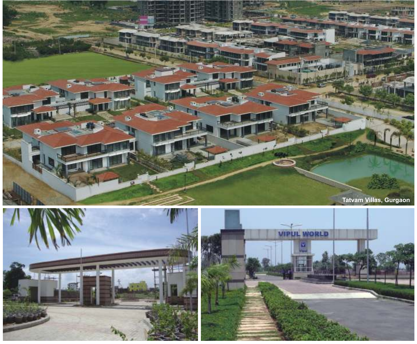
Vipul Garden, Bhubaneswar