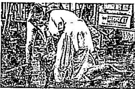
Police personnel detain an AWP activist in a search to identify a doctor in Kolkata on Tuesday, who is arrested against the rape and murder of a 27-year-old doctor.