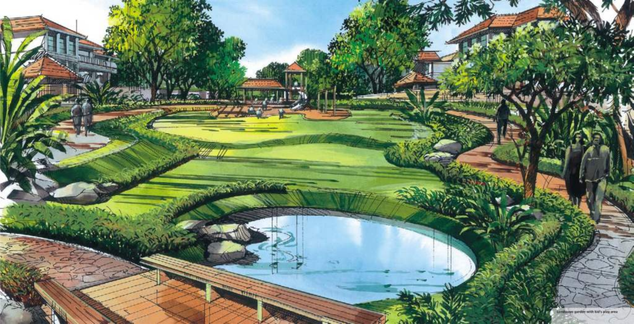
Landscaped garden with kid's play area