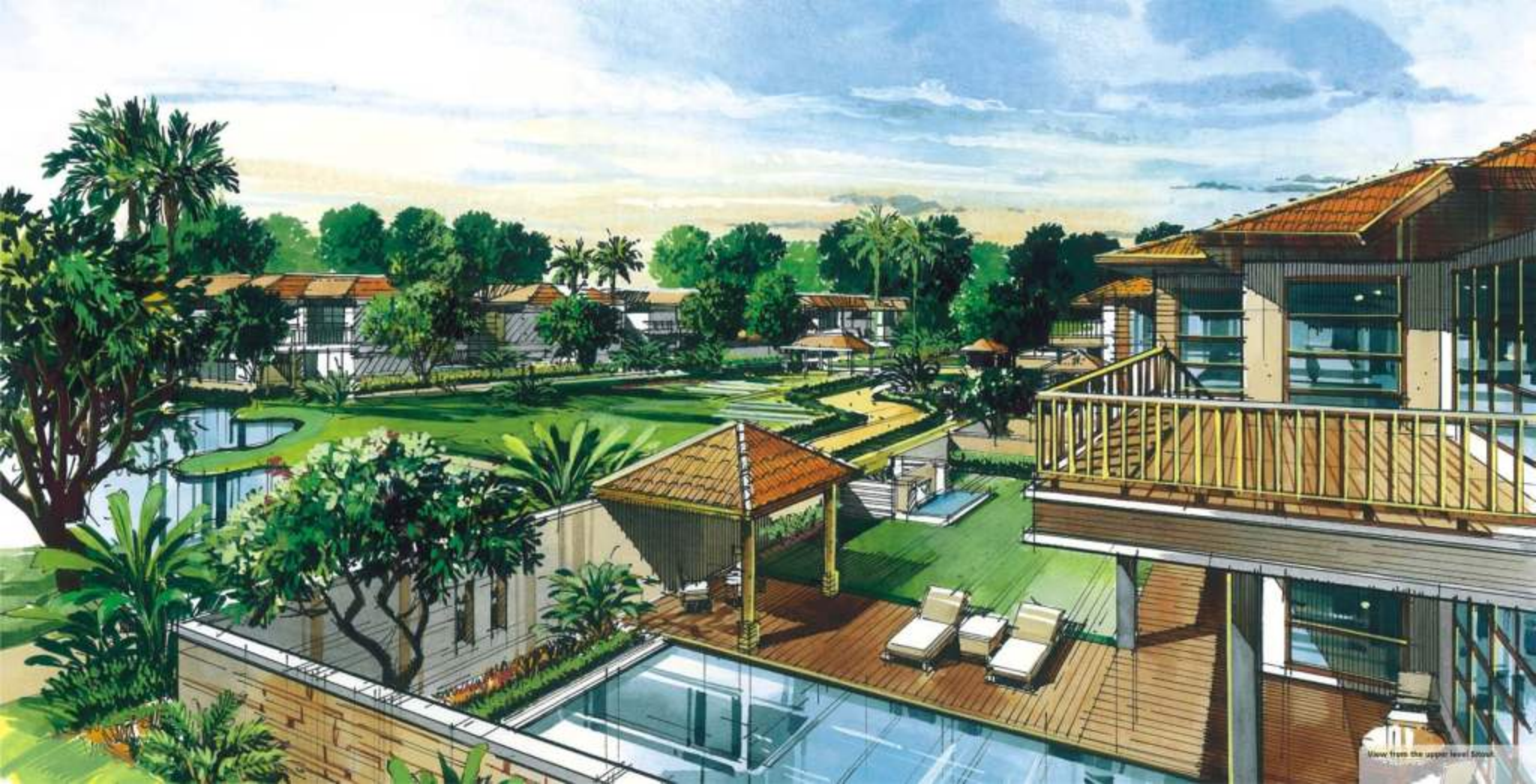
View from the upper level.