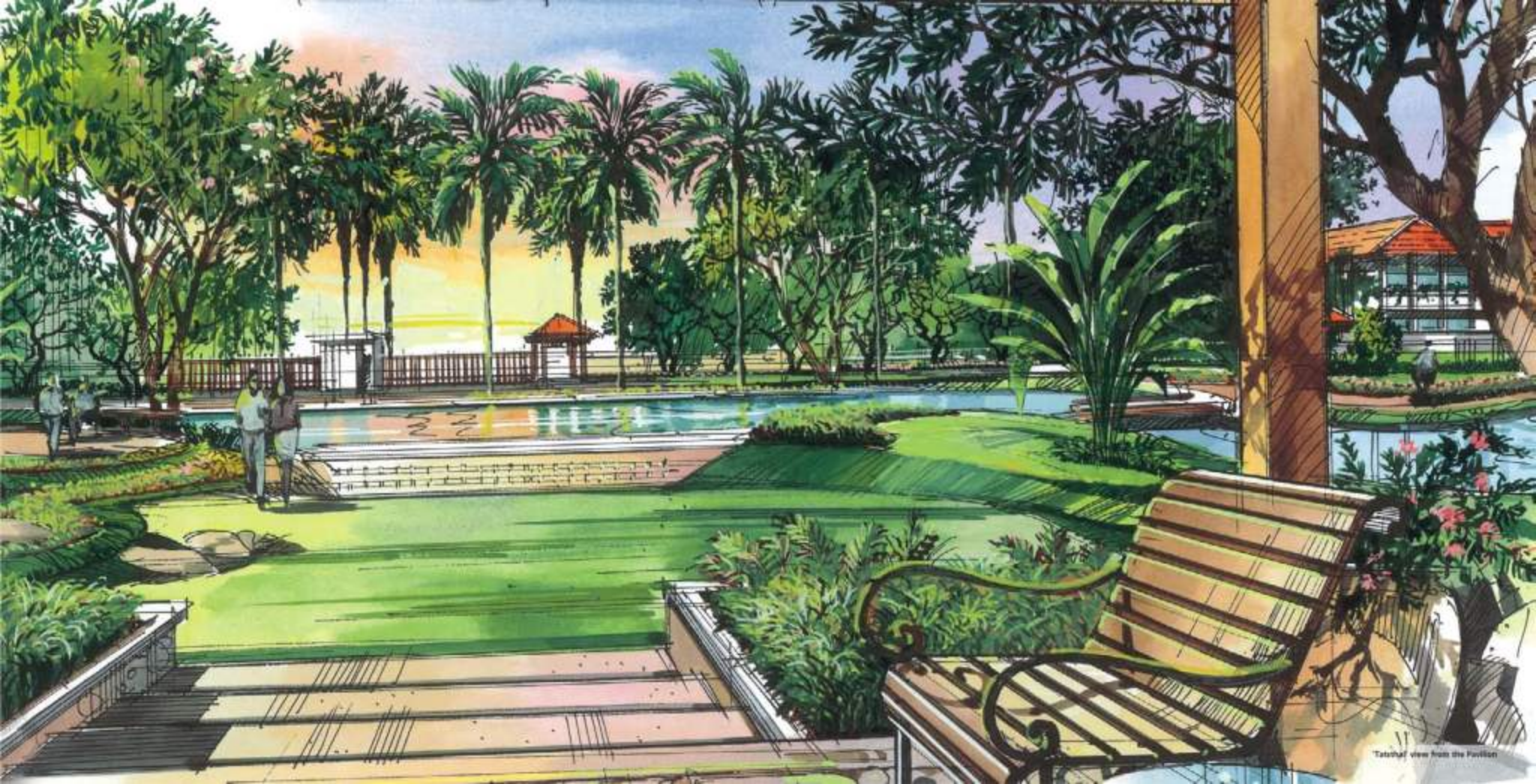
"Tatshah" view from the Pavilion