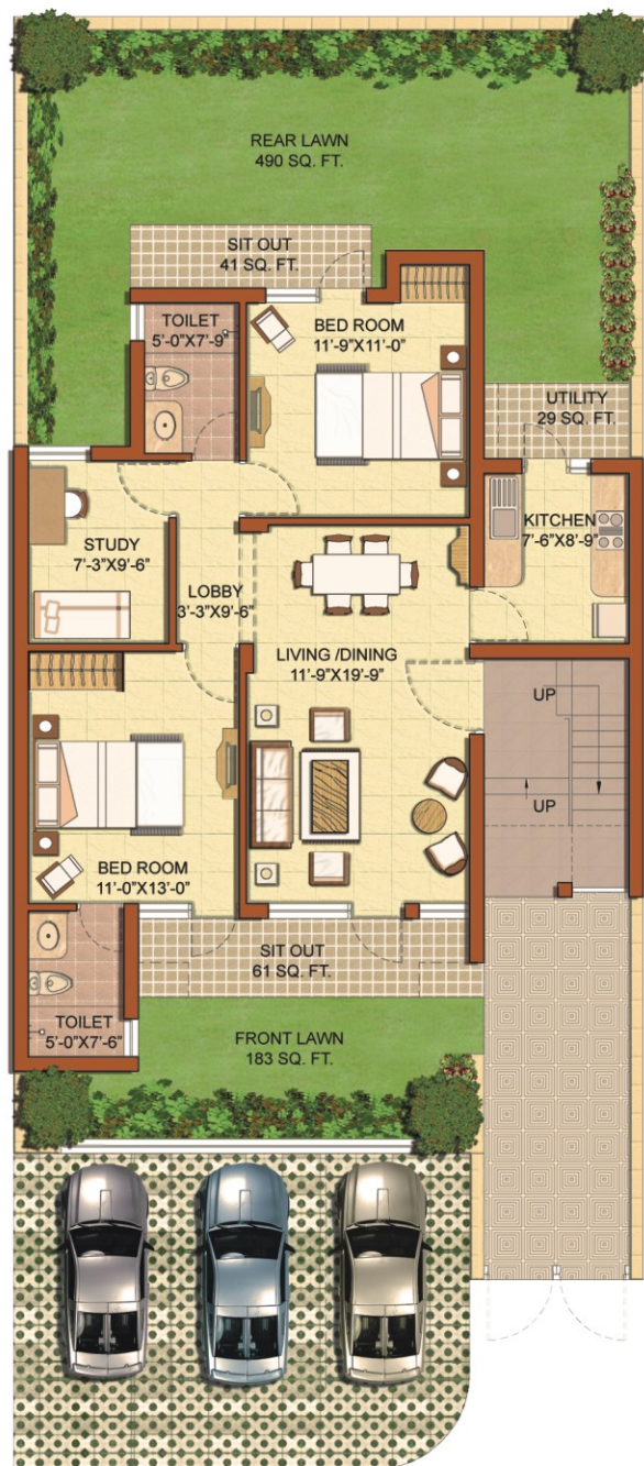
GROUND FLOOR UNIT Area : 109.6 SQ. MT. (1180 SQ. FT.)

Plot Size: 10x20 Mts. (200 Sq. Mt.) 240 Sq. Yds.