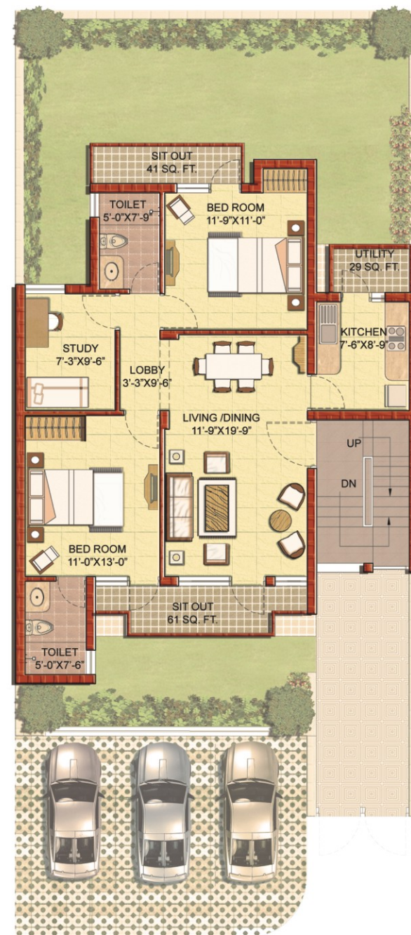
FIRST & SECOND FLOOR UNIT Area : 109.6 SQ. MT. (1180 SQ. FT.)

Plot Size: 10x20 Mts. (200 Sq. Mt.) 240 Sq. Yds.