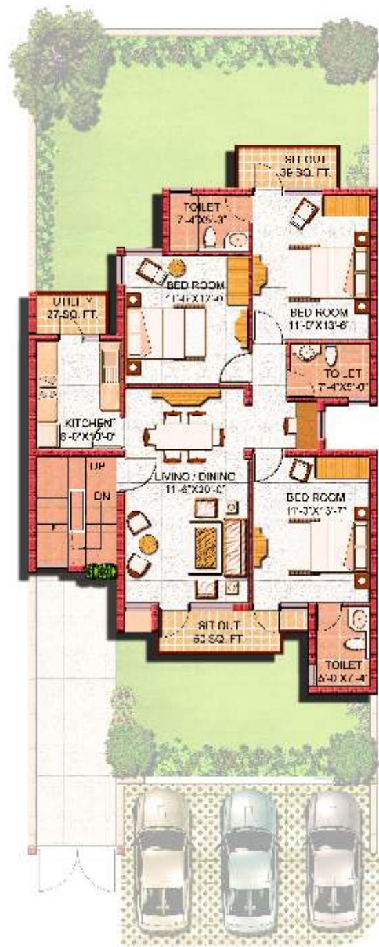
FIRST & SECOND FLOOR UNIT Area : 136 Sq. Mts. (1464 Sq. Ft.)

Plot Size: 10x23.5 Sq. Mts. 281.06 Sq. Yds.