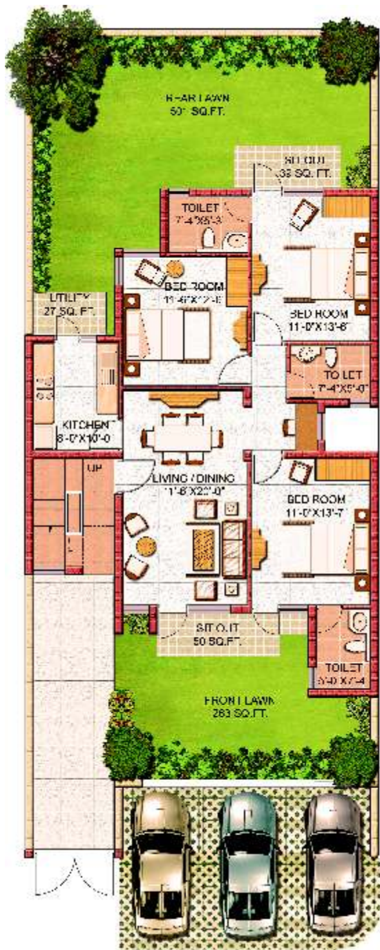
GROUND FLOOR UNIT Area : 136 Sq. Mts. (1464 Sq. Ft.)

Plot Size: 10x23.5 Sq. Mts. 281.06 Sq. Yds.