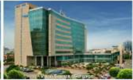
Vipul Vista, Gurgaon