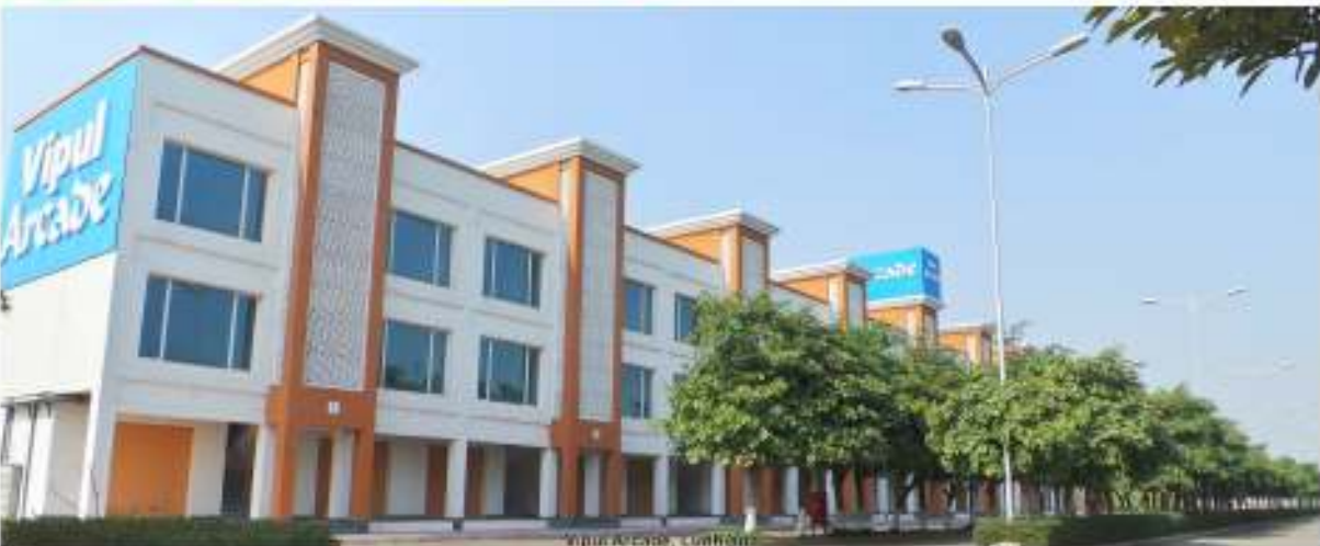
Vipul Arcade, Cuttack