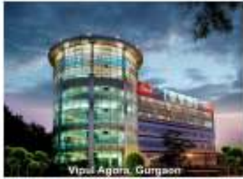
Vipul Agora, Gurgaon