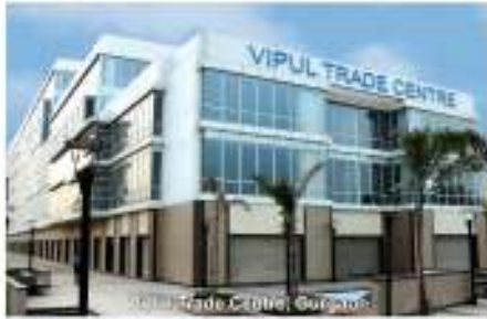
Vipul Trade Centre, Gurgaon