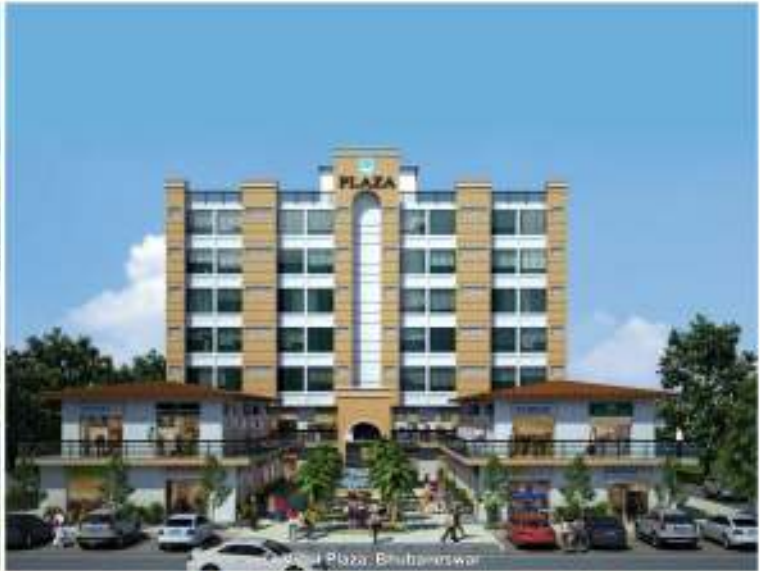
Vipul Plaza, Bhutanagar