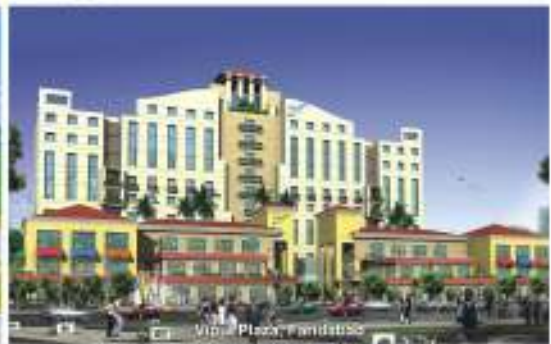
Vipul Plaza, Mandla