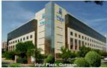
Vipul Plaza, Gurgaon