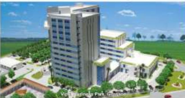
Vipul Business Park, Gurgaon