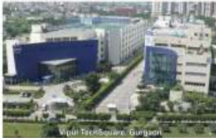
Vipul TechSquare, Gurgaon